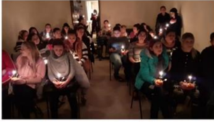
Christingle service at Casa Vieti